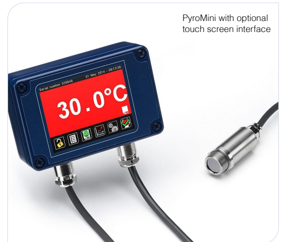
PyroMini with optional touch screen interface

One sensor is used to measure the temperature of each heating zone, so an even temperature profile is ensured throughout the whole sheet. For good temperature uniformity, at least ten points should be measured: all four corners and the centre of the sheet, on both the top and bottom surfaces.