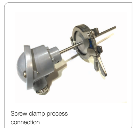
Screw clamp process connection