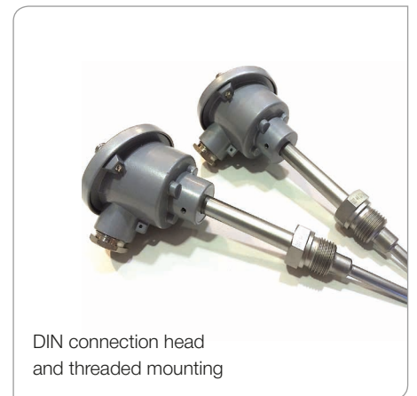
DIN connection head and threaded mounting