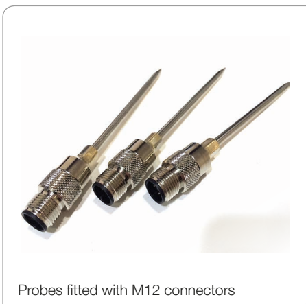
Probes fitted with M12 connectors