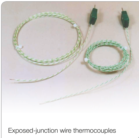
Exposed-junction wire thermocouples