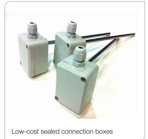
Low-cost sealed connection boxes